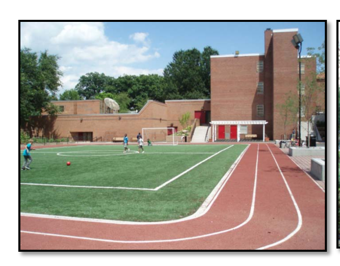
Small Athletic Field Bancroft Elementary School

Quality schoolyards are important places for elementary schools because outdoor activities are critical for growth, health, education and enjoyment. All children should experience pleasant and well-equipped outdoor environments on a daily basis.