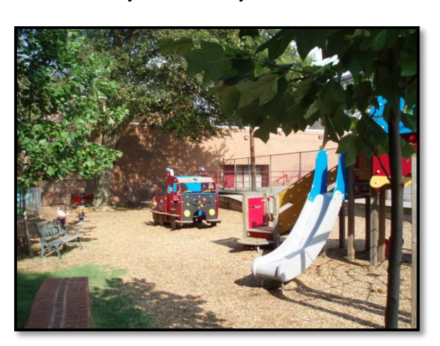
Early Childhood Area Bancroft Elementary School (former play area)