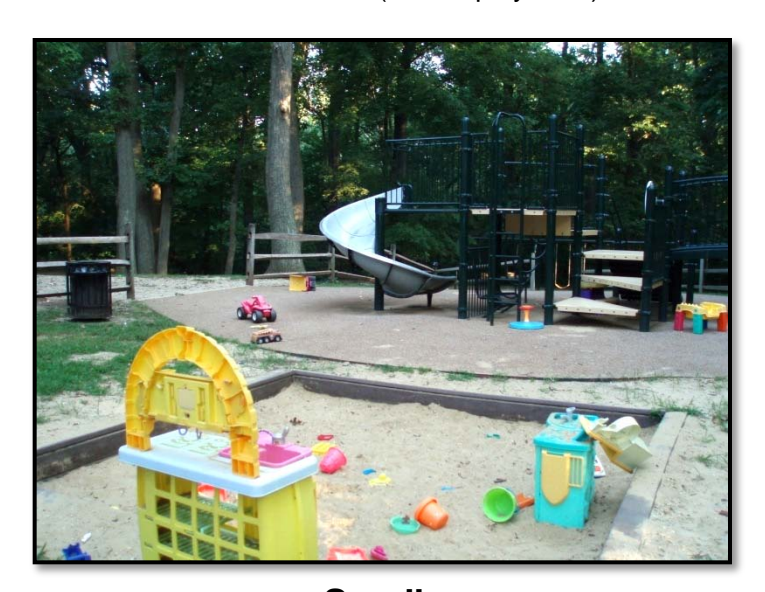
Sandbox Courtland Place Playground