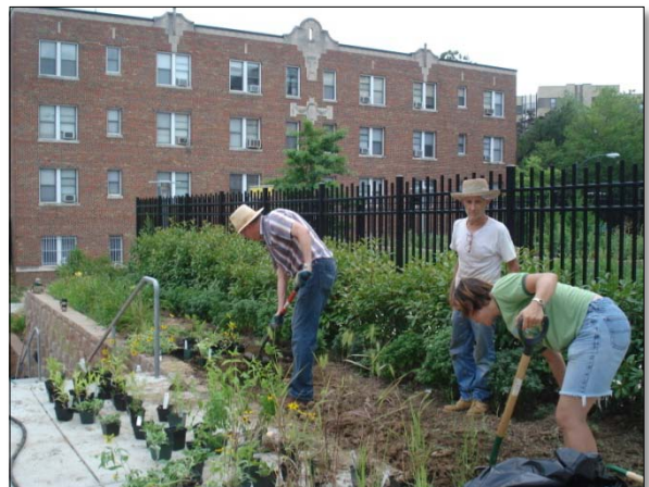
Planting a Butterfly Garden H.D. Cooke Elementary School