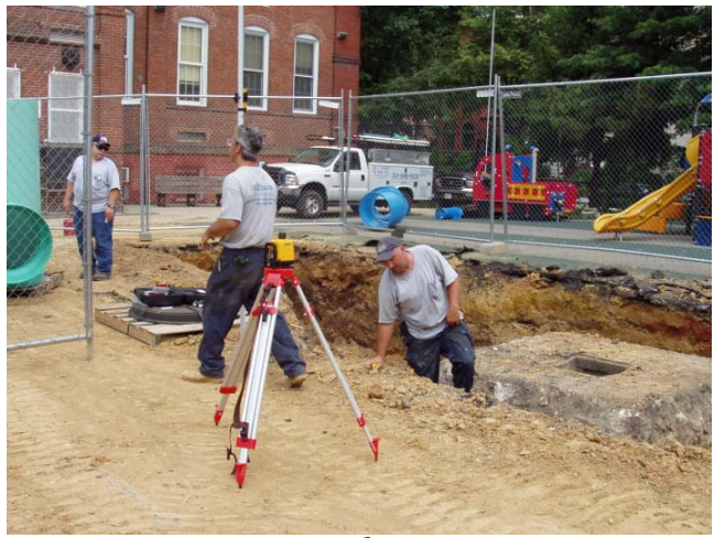
Measuring for Accuracy Ross Elementary School