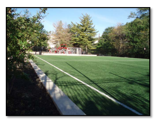
Small Athletic Field Eaton Elementary School