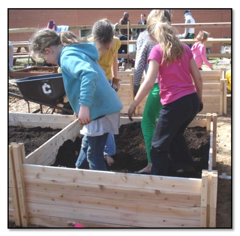
Students Help Build New Garden Boxes Stoddert Elementary School