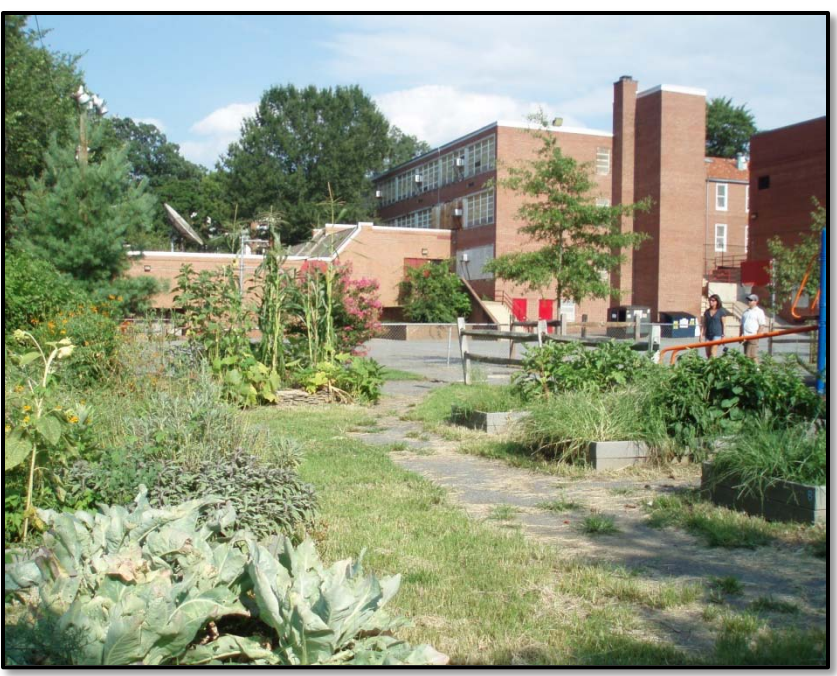
Wildflower Garden and Vegetable Beds (former)