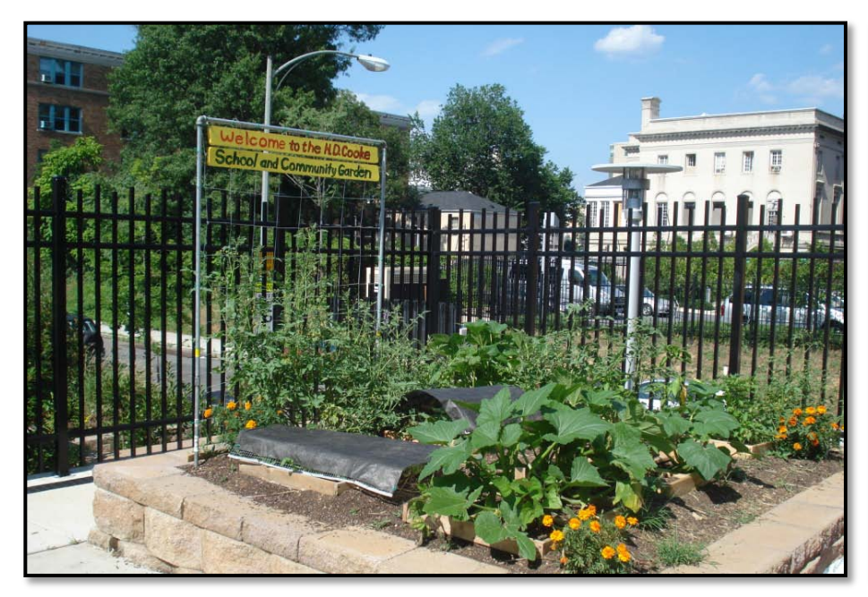
Squash and Marigolds in a Planter HD Cooke Elementary School

School gardens are an enjoyable way for children and families to appreciate how food grows. When children have the opportunity to plant and harvest fruits and vegetables they get firsthand lessons about nutrition and come to understand the importance of agriculture.