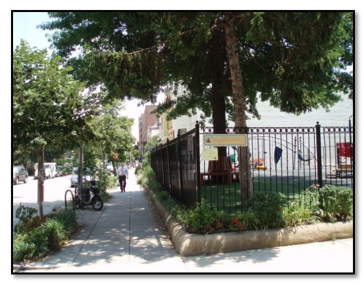
Playground Shade Tree Ross Elementary School