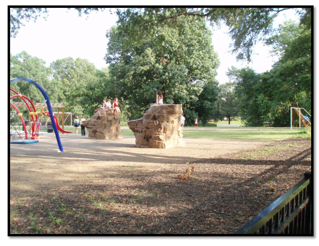
Students in High Quality Schoolyard Hearst Elementary School

Quality schoolyards provide opportunities for the physical challenges, exercise, sensory play, fantasy play, organized sports and unsupervised free play that allow for healthy, well-rounded development.