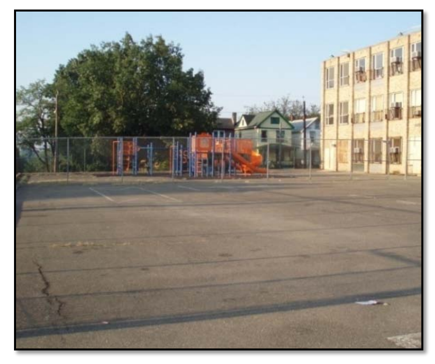
Poor Quality Hardscape with Old Equipment Martin Luther King Elementary School