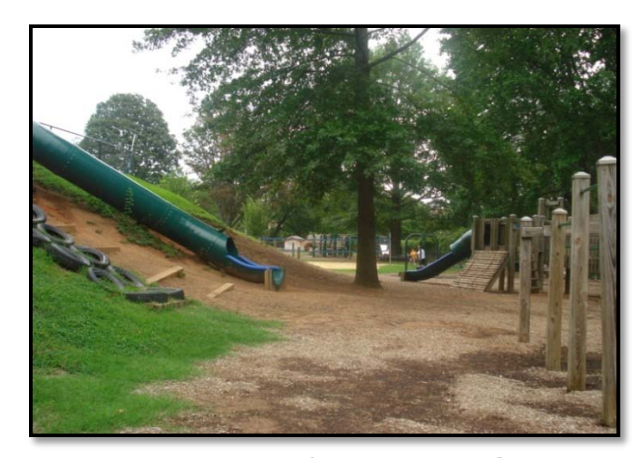
Play Area for Exploration Mann Elementary School