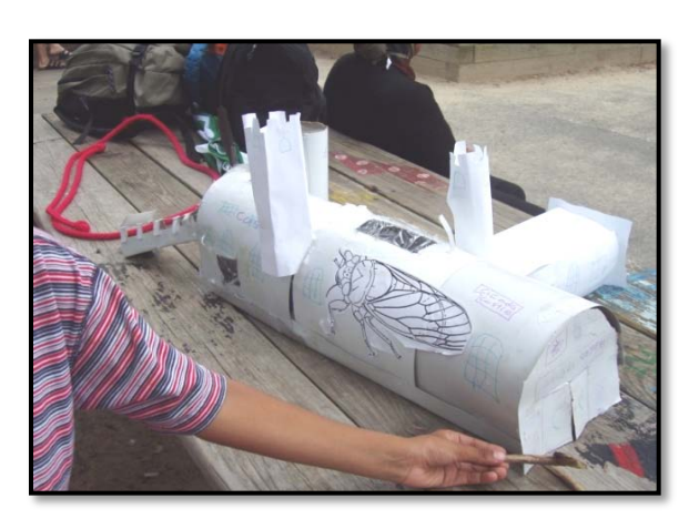
Cicada Cage Project Stoddert Elementary

Effective environmental science instruction often includes complex outdoor experiences.