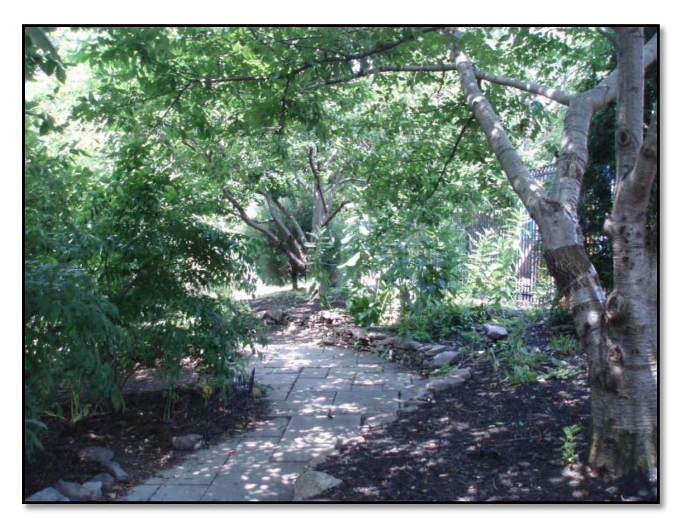
Environmental Habitat Area Bancroft Elementary School

Places for children to engage in fantasy play enhance skills such as creativity, communication and problem solving. Schoolyards can invite imaginary play with features that stimulate the imagination but are not overly designed, leaving lots of space and materials for improvisation.