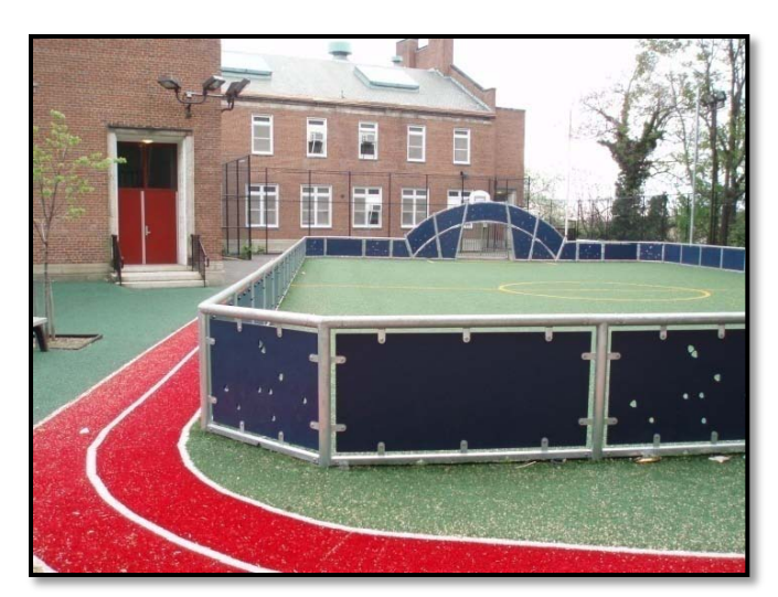
Versatile Small Artificial Turf Field Oyster/Adams PK- 8 Upper School

Participating in organized sports can be rewarding for children; it can build the foundation for a lifetime of enjoyment. Team play embodies a wealth of values that transfer to the adult workplace.