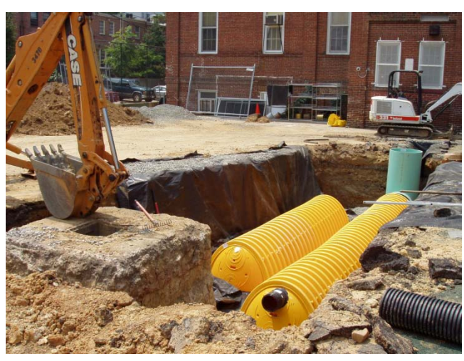
Underground Storm Water Control Ross Elementary School