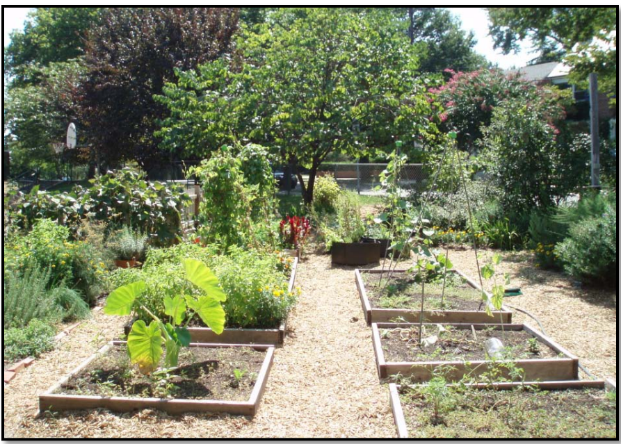
Raised Garden Beds with Wide Walkways Mann Elementary School