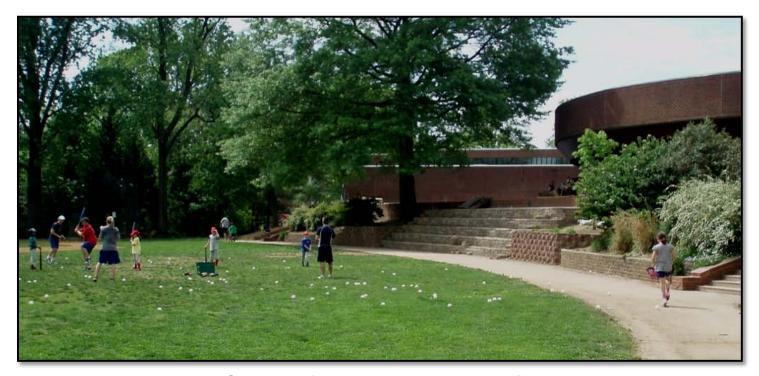
Sunday Afternoon Baseball Practice Lafayette Elementary School

High quality schoolyards contribute to community vitality. They provide readily available green space, sun, shade and enjoyable natural habitats for residents within walking distance. Schools are important as community parks, community gardens and neighborhood gathering places.