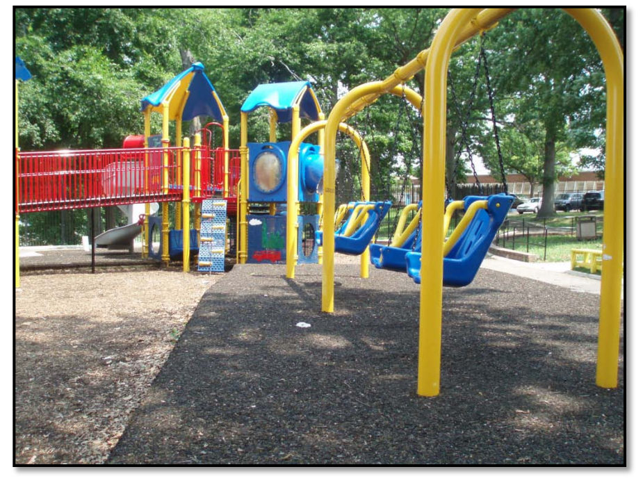
Swings for All Ability Levels Sharpe Health Special Education School