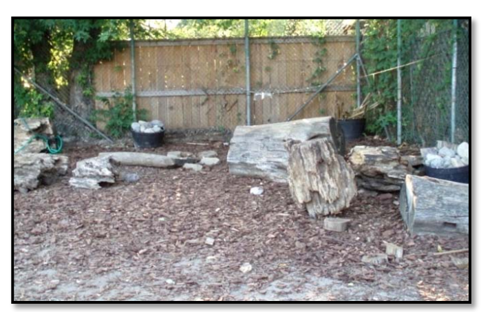
Climbing/Seating Stumps Peabody Elementary School