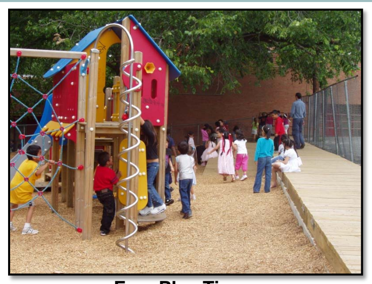
Free Play Time Bancroft Elementary School (former play area)