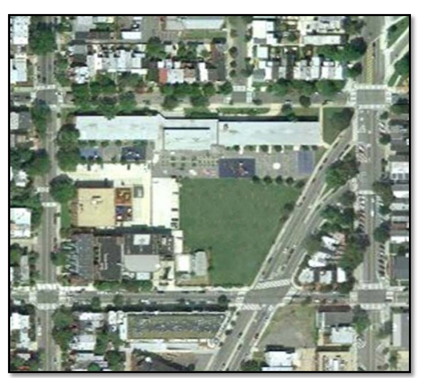
Row Houses, Streets and Parking Lots Surround School Playing Field Garrison Elementary School