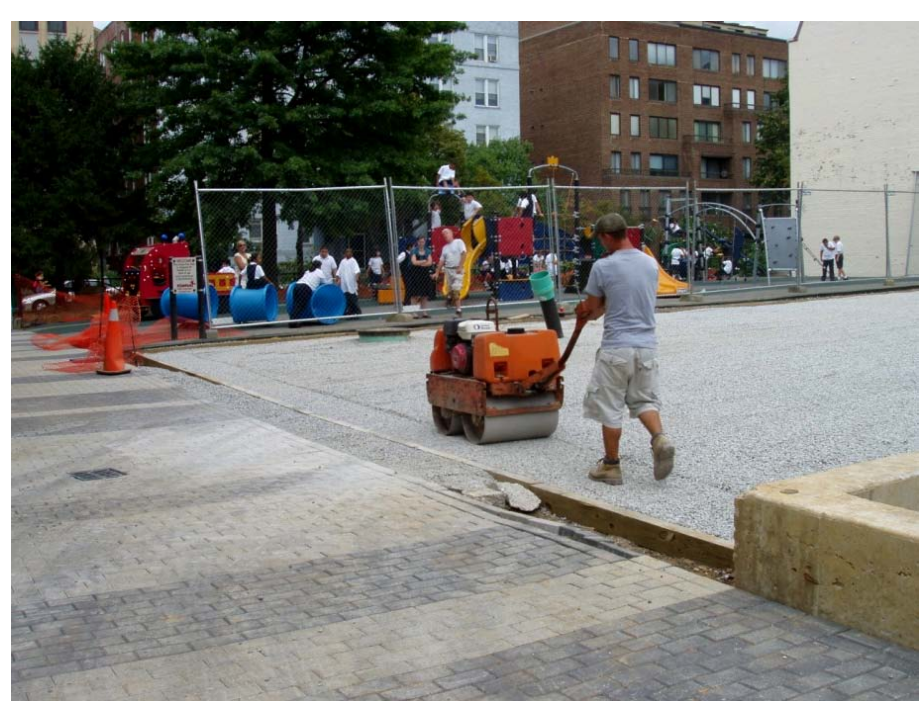
Students Watch Turf Field Installation Ross Elementary School

Construction is exciting, time-consuming and bothersome. But it can be an great learning experience for students.