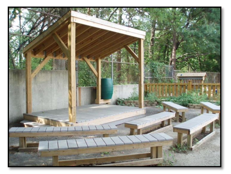
Outdoor Performance Space DC Prep Academy, Benning Elementary Campus