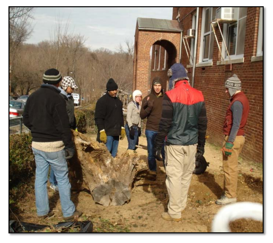
Volunteers Dig Up and Move a Dead Tree Stump Bancroft Elementary