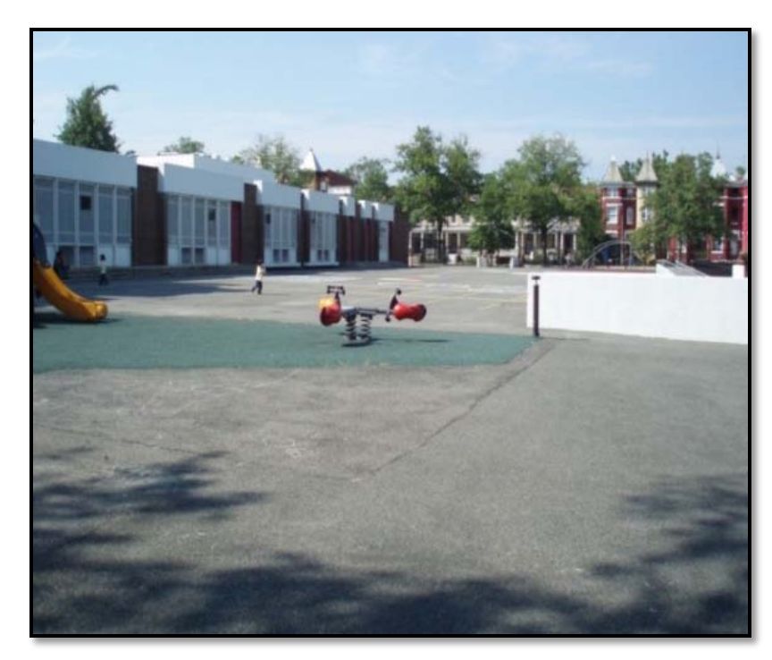
Poor Quality Hardscape with New Equipment Harriet Tubman Elementary School

Many schools do not have inviting playgrounds. Poor quality schoolyards, like these examples, may have new play structures but still not be welcoming to children or adults. There is little to no shade, water, seating, social areas or any natural environment for children or adults to learn from or enjoy.