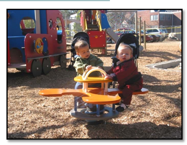
Toddlers Bouncing Bancroft Tot Lot (former play area)