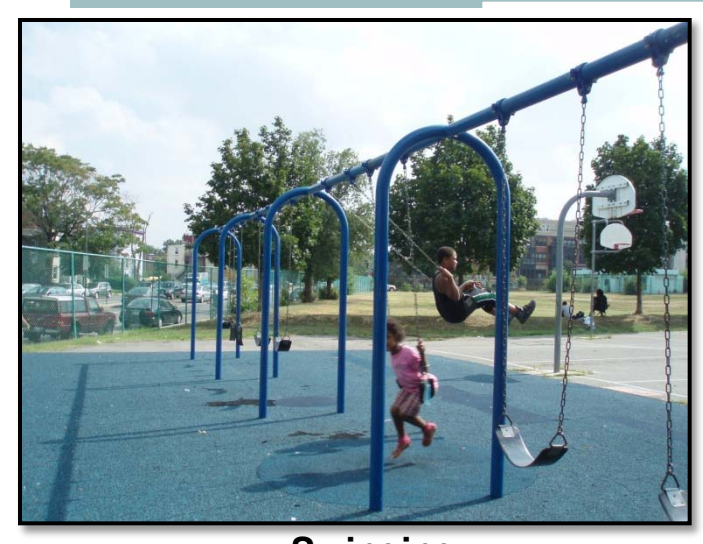
Swinging Garrison Elementary School