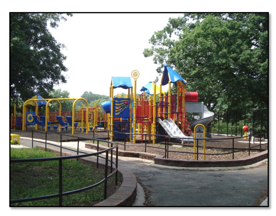
Accessible Play Area Sharpe Health Special Education School

Outdoor play areas and classrooms designed with wide pathways, specialized swings and low transfer platforms can accommodate all children.