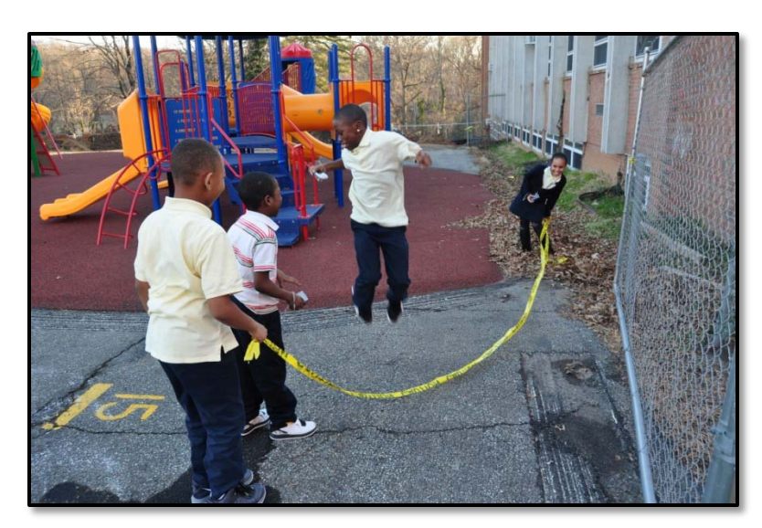
Improvised Jump Rope Kimball Elementary School

Besides hard surfaces for jump rope and basketball, it is important to have grassy areas for organized field sports or just for informal play.