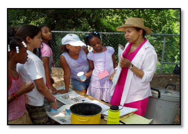
Learning About Soil Bancroft Elementary