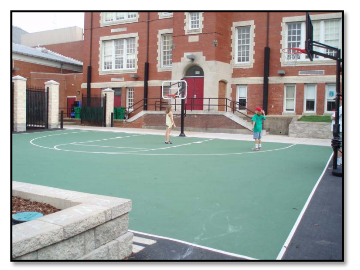
Basketball Court Eaton Elementary School