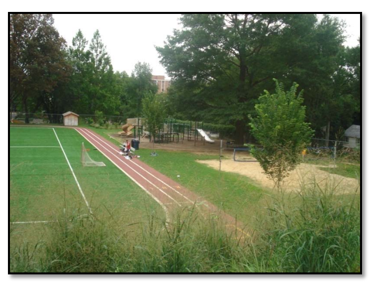
Small Track and Volleyball Court Mann Elementary School