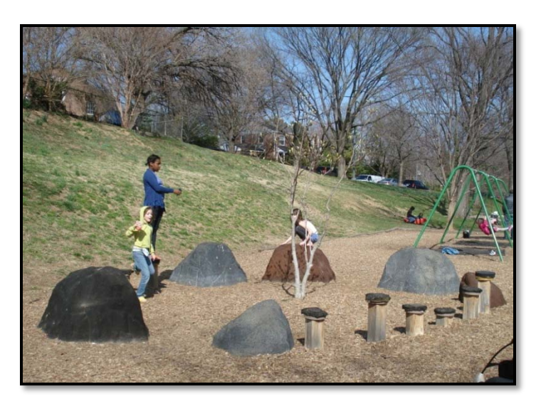
Boulder Climbing Circle Guy Mason Recreation Center

Informal social play is critical to healthy development. Creative games with child-negotiated rules and cooperative projects are as important as organized team sports.